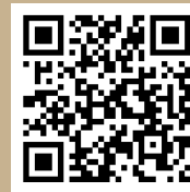
Volunteer Motivation and Maintenance

The face of volunteerism is ever evolving. One of the most important, and crucial components to volunteer improvement groups is its talent, or the volunteers involved in the organization. It’s good to have a handle on volunteer motivation , and how to recruit, recognize and retain your volunteers. Taking time to understand generational differences in the areas of communication and connection is vital to the success of your endeavors.