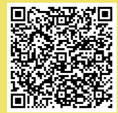
Newcomers Event Guide

...engaging newcomers to your community with a dinner with no strings (meaning no pitches to have them join an organization in your community) does wonders for newcomer moral and can increase their chances for getting involved in community work? Check out the Newcomer’s Event Guide provided by K-State Research and Extension to learn more!