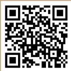
Telling Your Story

Few of us remember the “before” pictures until after we’ve done the work. Telling Your Story helps you identify ways to be intentional about collecting your impact (such as your quarterly reports) and how to craft a dynamic message that can effectively communicate the focus of your organization, the projects that you’re involved with and the impact you have in your community. If you’re looking for potential partners (funding or otherwise) another great tool to utilize is our Telling Your Story Template .