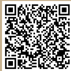
Telling Your Story Template